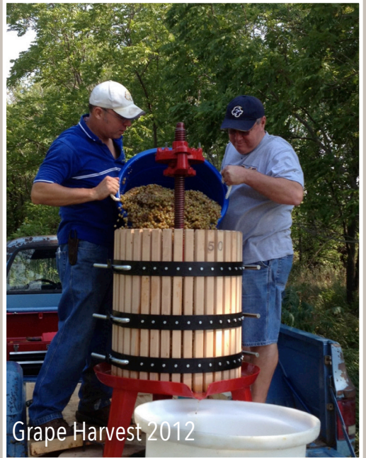
Grape Harvest 2012

In fall 2012, HCC harvested the first crop from the vineyard north of Wamego. The harvest yielded approximately two tons of fruit. HCC also became a bonded, licensed winery in 2012, and the first vintage of wine is now bottled and labeled at the Highland Community College Winery in Wamego. The first vintage is approximately 200 gallons (1000 bottles) of wine, and was released on July 1, 2013.