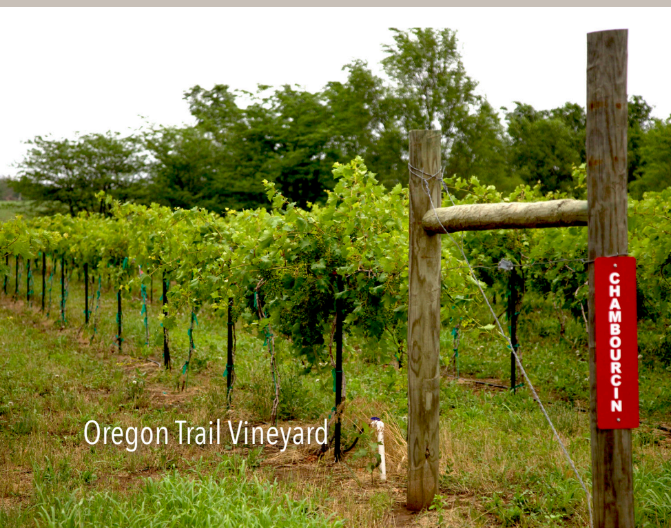
Oregon Trail Vineyard